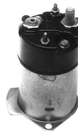
18-5804 STARTER SWITCH