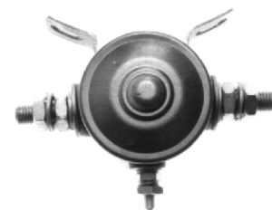
18-5840 STARTER SWITCH