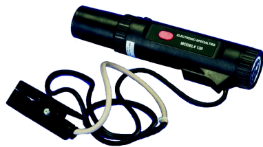
18-9802 TIMING LIGHT

Self-powered accurate up to 10,000 RPM's